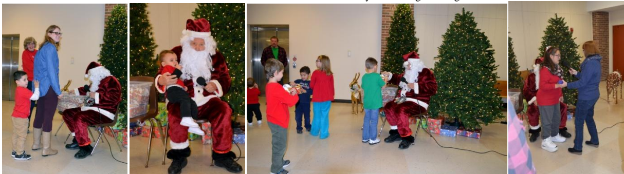
And of course, Santa was there!