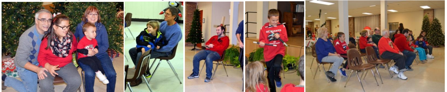
A few of the attendees at the children's Christmas Party and during the Magic Show.