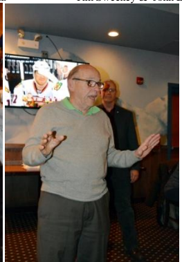
The George Steiner Speech