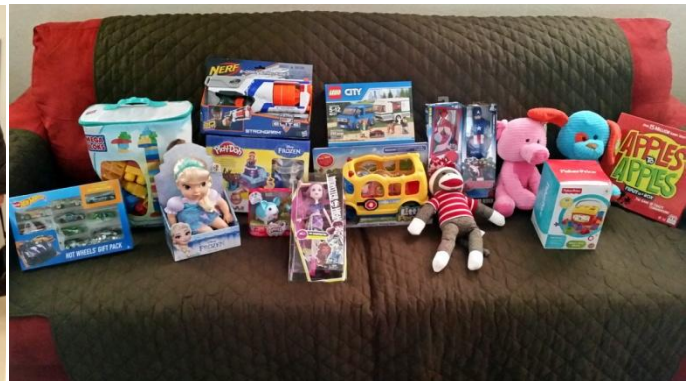
The End Results